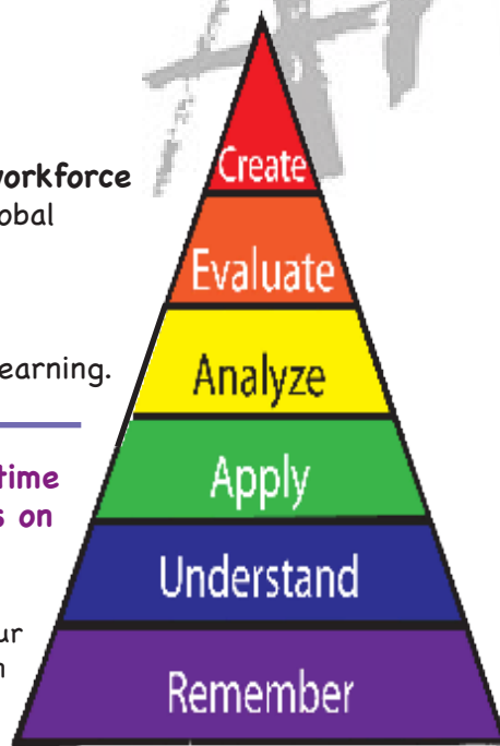
Redesigned Bloom's Taxonomy

The process of creating is what we want our students to do when we ask them to learn the core standards to mastery!